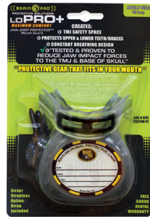
5x7 Backer Card