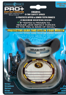
5x7 Backer Card