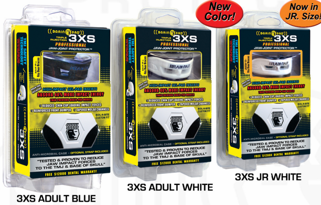
3XS ADULT BLUE